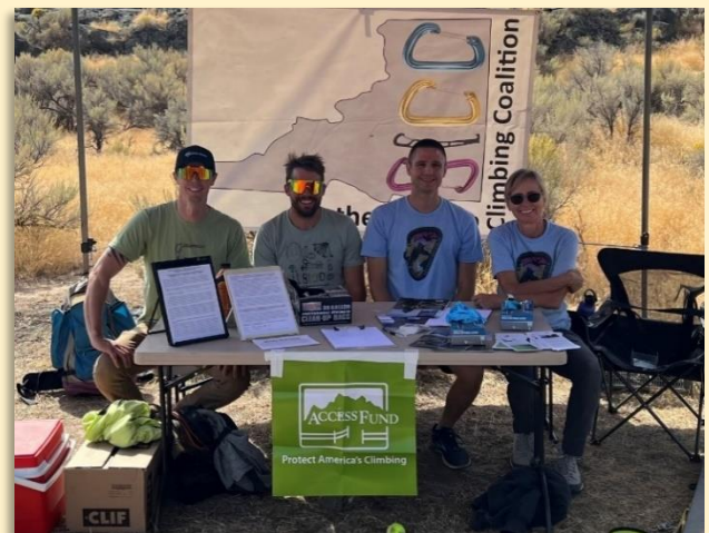
"SICC board members volunteer to help with Dierkes Boulderfest Crag Cleanup."

We are looking forward to a new year with new possibilities. Continue to support your Local Climbing Coalition and stay tuned for new updates. If you have any questions or concerns email us at info@climbsicc.com